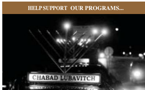
Chabad's Chanukah Car Menorah Parade from the Chabad Center to Suburban Square is an annual community highlight. Over 20 cars adorned with menorahs on their car tops proceeded slowly down Montgomery Avenue to publicize the miracle of Chanukah.

Seven days you shall bring offerings by fire to the Lord. On the eighth day you shall observe a sacred occasion and bring an offering by fire to the Lord; it is a solemn gathering: you shall not work at your occupations.